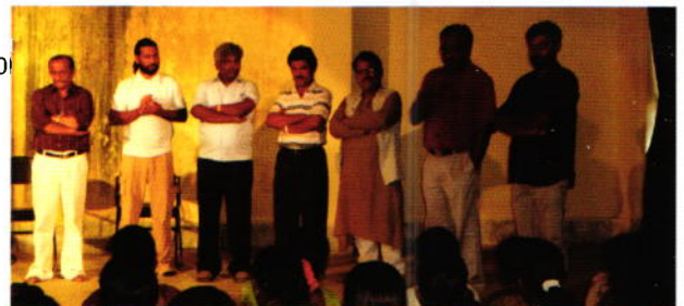
Adaptation & performance of Play "The Bet" by Chekov in Kannada