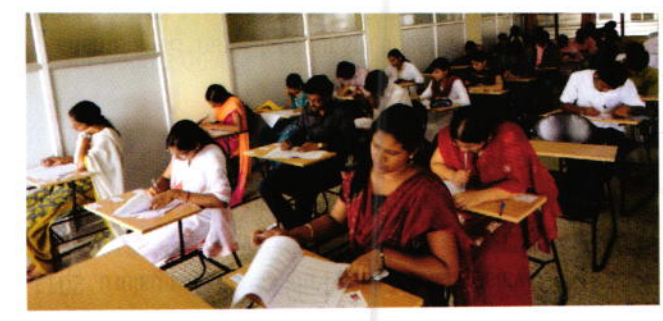
University sessional Exams in progress