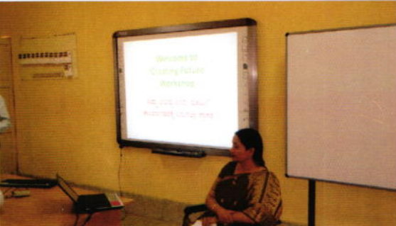
Interaction with officials at one day workshop on "Creating Future"