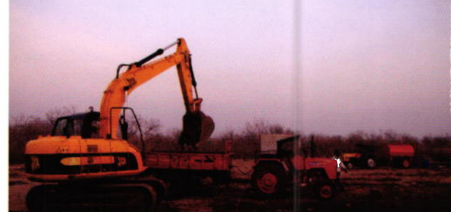
Work of Construction at the campus