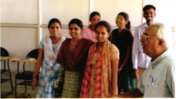
Vibrant student interaction with guest and invited faculty